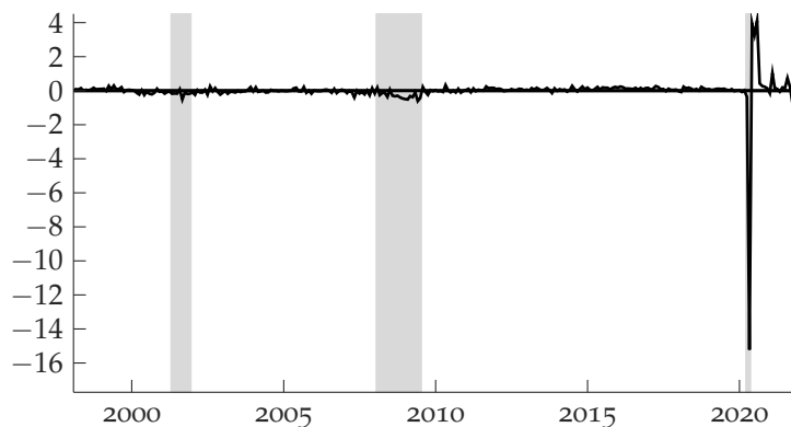
Detroit Economic Activity Index (standard deviations from trend)