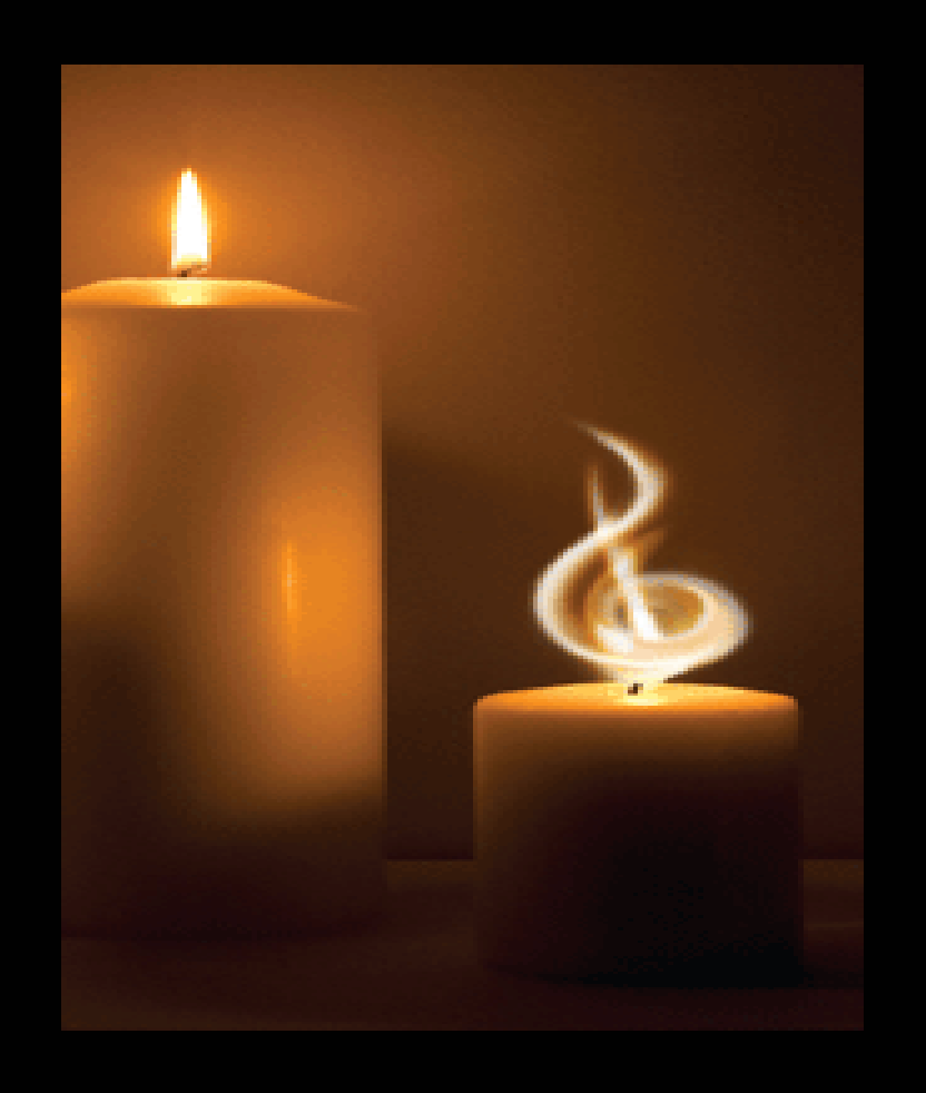
Happy Holidays & Best Wishes For The New Year