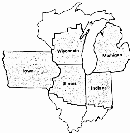
Figure 1 The Seventh Federal Reserve District

understate the rate at which manufacturing activity is expanding.