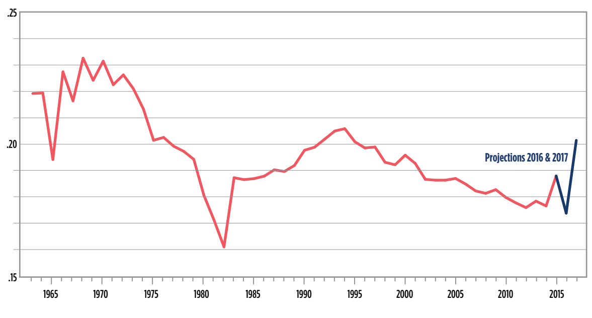
Chart 2. Ratio of UI dorm rooms to students. 1963–2017

as chart 3 illustrates. Since 1980, median gross rent in Johnson County has increased by 35 percent after inflation, while median household income has increased by 29 percent after inflation. Among renter households, however, the income picture is more concerning; real income in 2014 dollars has actually declined by 13 percent over this period, from $30,186 in 1980 to $26,262 in 2014. Not surprisingly, rental households with annual income of less than $20,000 experienced the highest cost burden of all income groups, with almost 100 percent, spending 30 percent or more of income on rent. Yet even among rental households with more typical income of $20,000 to $35,000 (the county's median renter income is $26,262), 82 percent experience cost burden. Rental cost burden is also elevated across multiple age groups. Almost 80 percent of very young households (age 15 to 24) are cost burdened. Many of these households are likely UI students and are unable to work full time or are out of the labor force all together, leaving their income low enough to necessitate spending over 30 percent of it on rent. But even among working age households, the rate of cost burden is over 40 percent, and for senior renter households age 65 and older, the rate of cost burden is an even higher 59 percent.